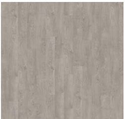
Parquet Grey Ashwood