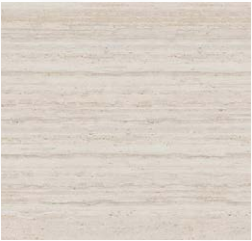
Travertino Pearl Porcelain