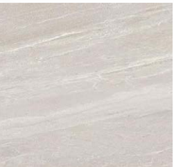
Faience Museum Mainstone Cloud Mat